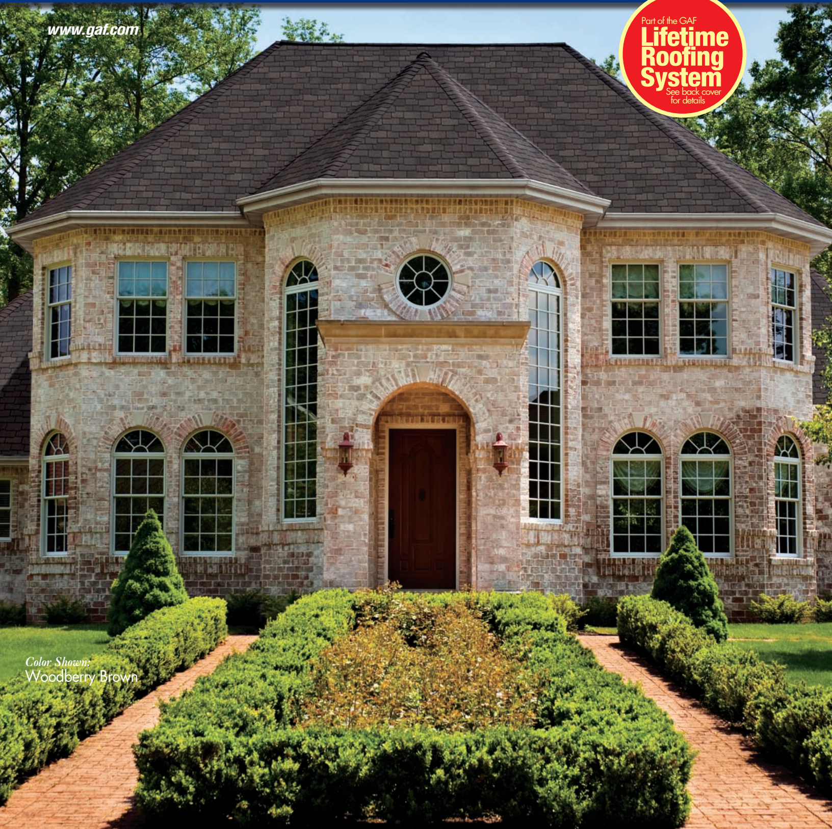
Color Shown: Woodberry Brown