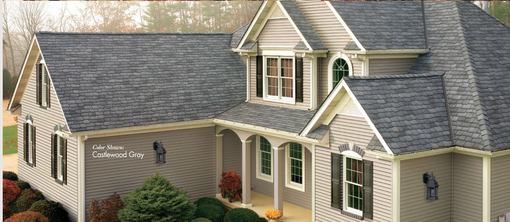
Color Shown: Castlewood Gray