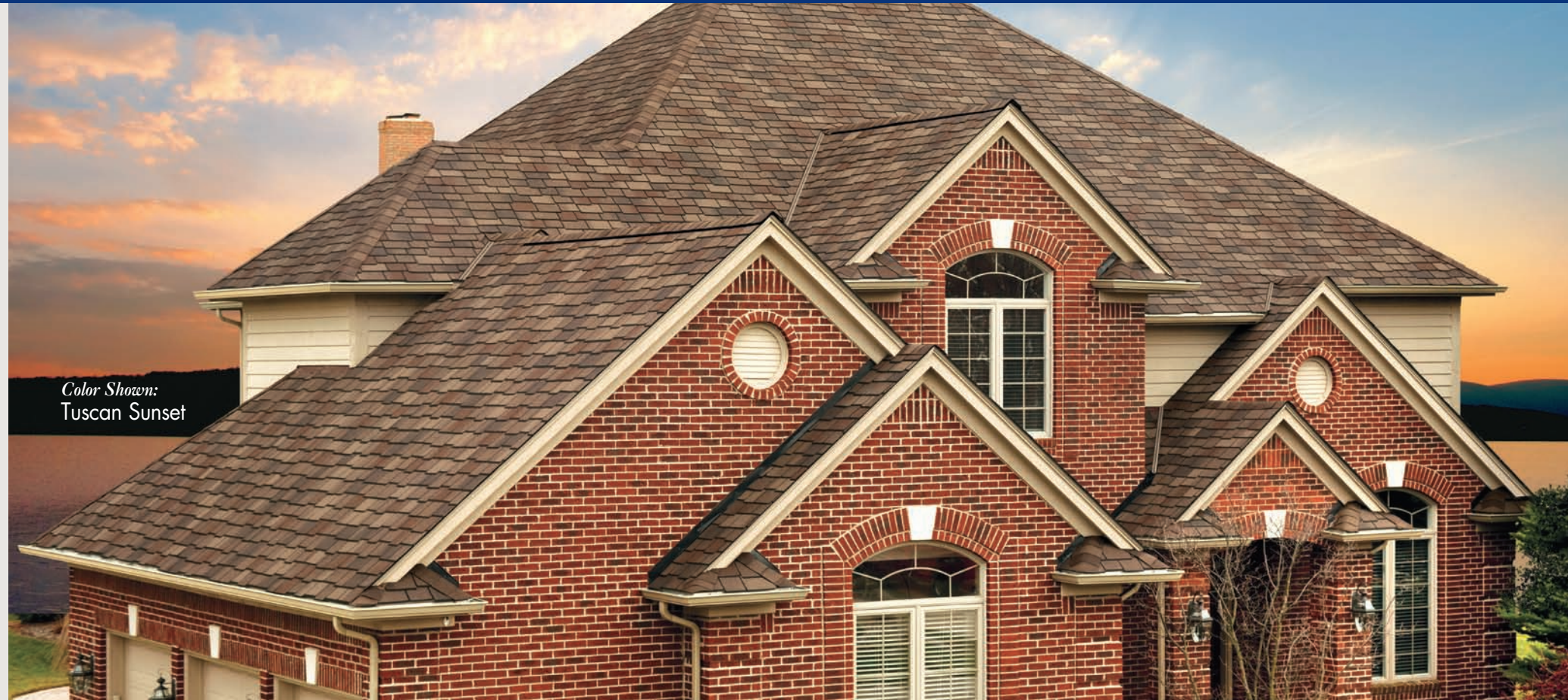
Color Shown: Tuscan Sunset

Note: It is difficult to reproduce the color clarity and actual color blends of these products. Before selecting your color, please ask to see several full-size shingles.