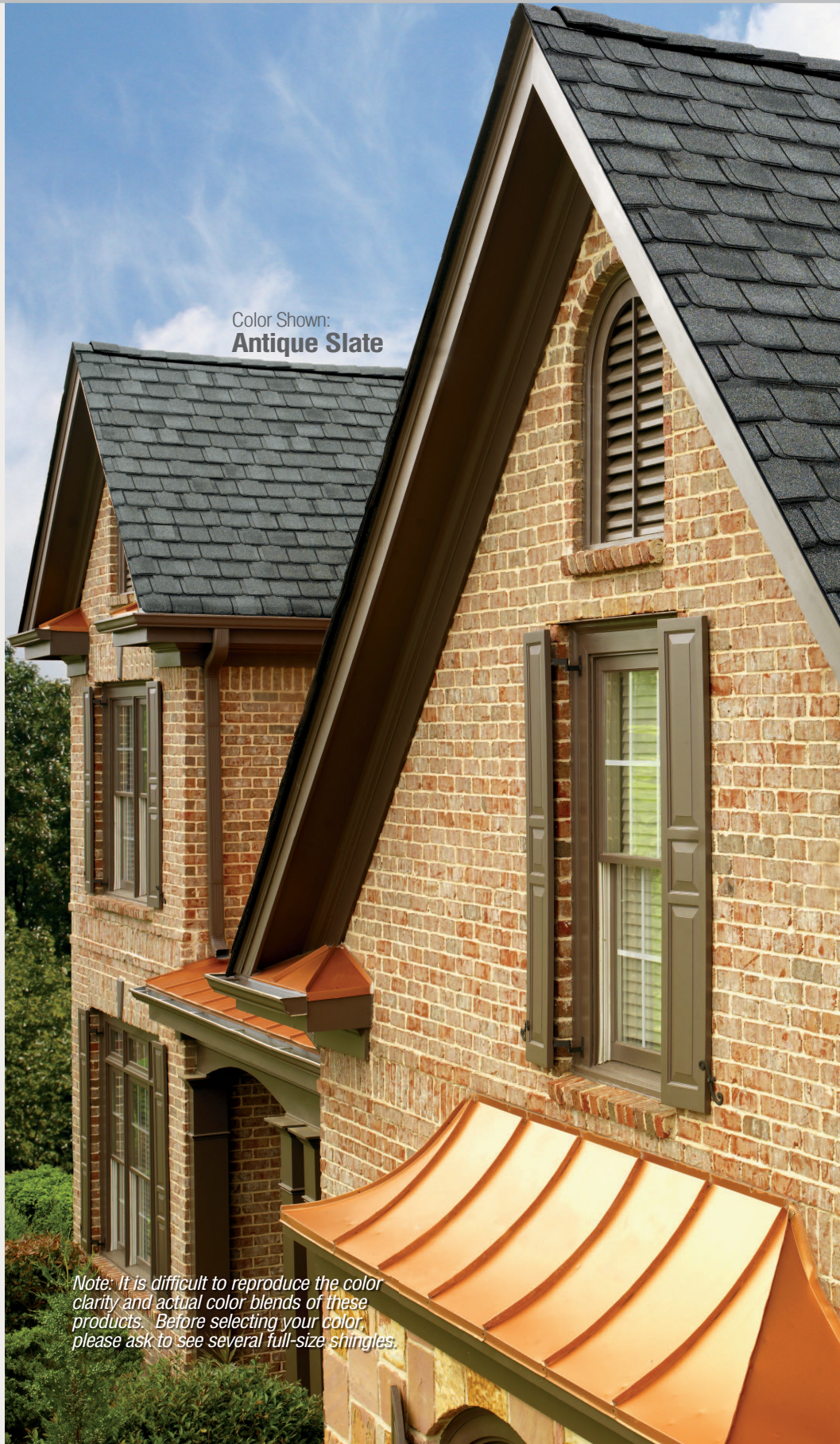
Color Shown: Antique Slate

Note: It is difficult to reproduce the color clarity and actual color blends of these products. Before selecting your color, please ask to see several full-size shingles.